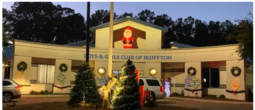
Christmas Drive-Through Served 750 families!!

Christmas Celebration Drive-through 2020!