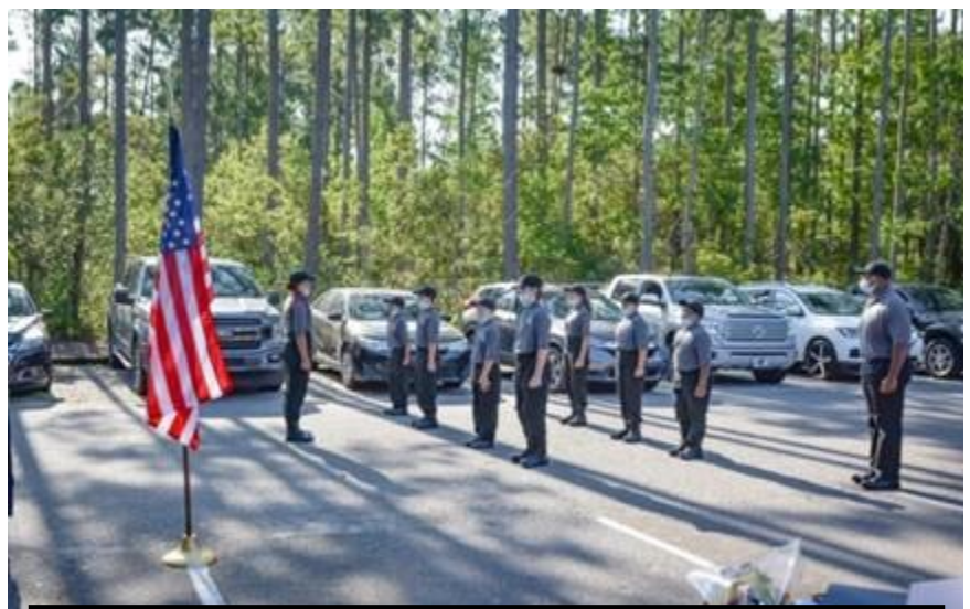
Graduation from Boot Camp, Explorers LEAD 2020